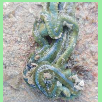
Green leaf worm