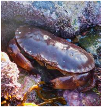
Edible crab / Chancre crab

Always place rocks back where you found them and the right way up. Handle creatures with care and respect.