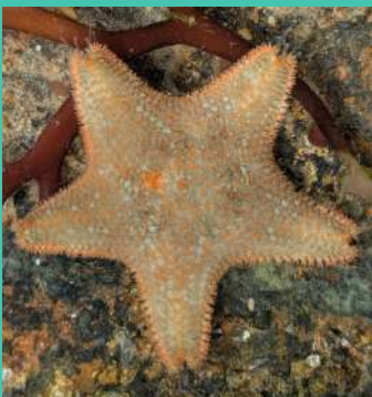
Cushion star Asterina gibbosa