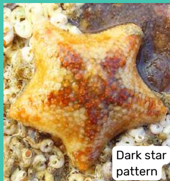
Cusion star Asterina phylactica