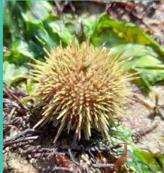
Shore sea urchin