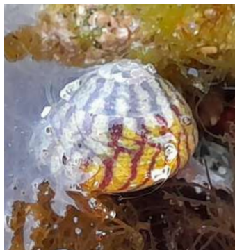
Flat top shell