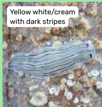
Candy striped flatworm