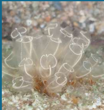
Light-bulb sea squirt